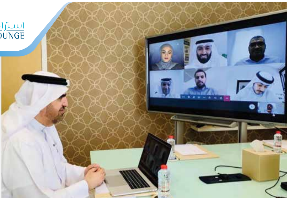
Right: Manager Lounge as a part of Knowledge Lounge